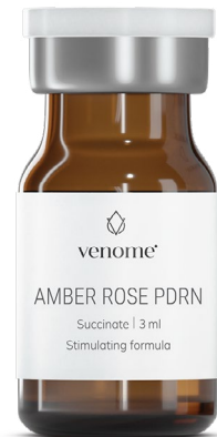
● VENOME AMBER ROSE PDRN