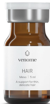
VENOME MESO HAIR