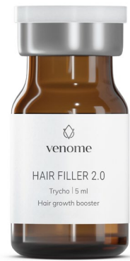
VENOME HAIR FILLER 2.0

A trichological therapy with revitalising properties, combining Venome Hair Filler 2.0 and Venome Meso Hair as a unique treatment for weak hair prone to excessive loss.